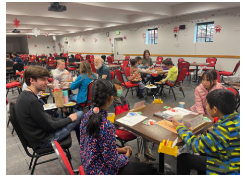
3 tables of brand-new players!