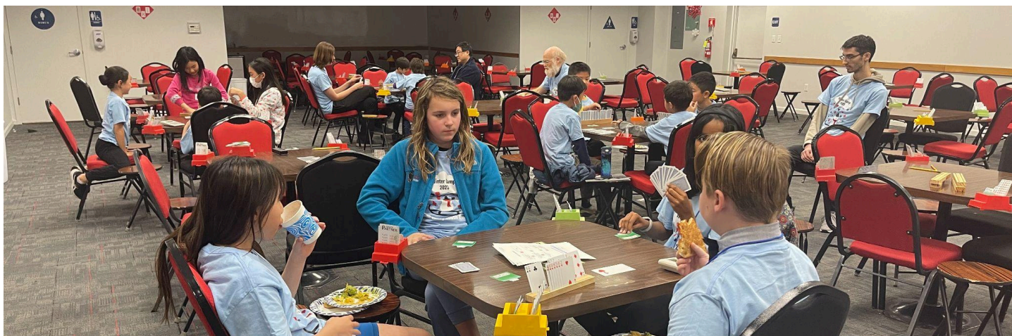
Campers play in the duplicate tournament following the instruction days of the camp

New players learned mini-bridge on Day 1, declarer play technique on Day 2, bidding on Day 3, and played in their first tournament on Day 4. Amber Lin, Kai Eckert, Will Watson, and Cornelius Duffie led the new players. The program included lessons, supervised play, and some fun activities such as races for sorting hands, counting HCPs, and completing the shape. There was also suit-symbol cookie decorating and bridge-themed team trivia.