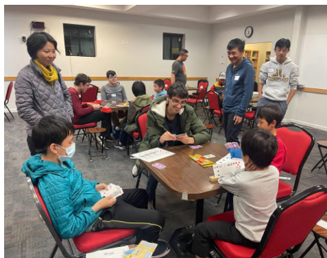
A bustling room of SiVY kids, parents, and volunteers.