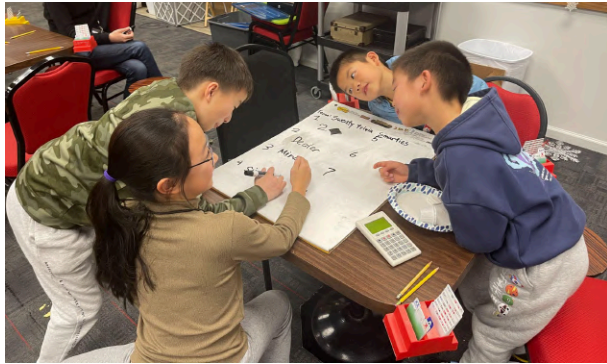
Team "Sweaty Trivia Smarties" solving bridge trivia