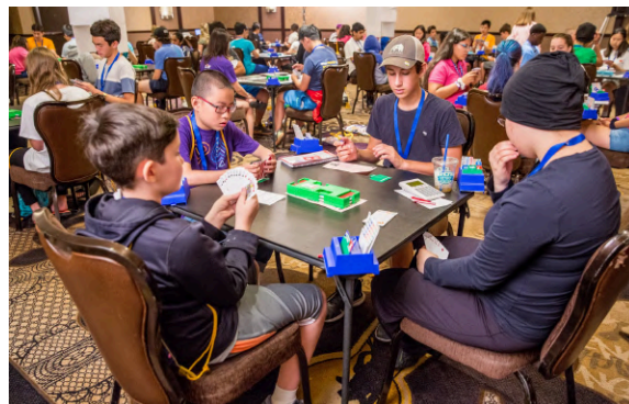
N/S are SiVY kids competing in the 2019 YNABC (so are players wearing the same purple shirt as North)