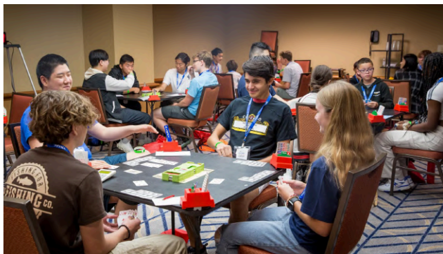
Big room of fun at 2023 Youth NABC in Chicago

The Youth NABC will be held in Toronto, July 25-27 . This amazing tournament is the pinnacle annual event of the youth bridge community. Hundreds of young players attend. Prizes include $1,000 scholarships in the main pairs and teams events. We would love to bring a large SiVY cohort as a part of this celebration of bridge! SiVY members may also apply for a $600 stipend to help with travel costs. We are looking forward to seeing everyone there!