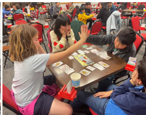
Celebrations after making 4♦x with two overtricks!