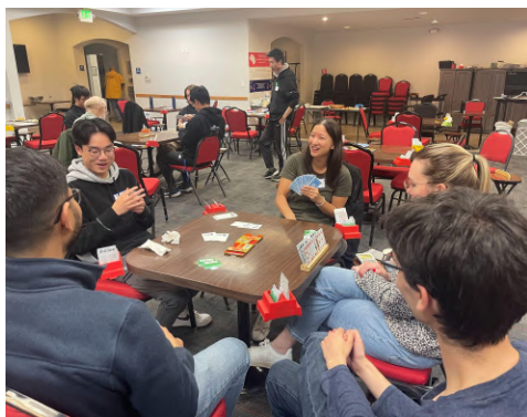
Young Adults playing their first bridge game at SiVY.